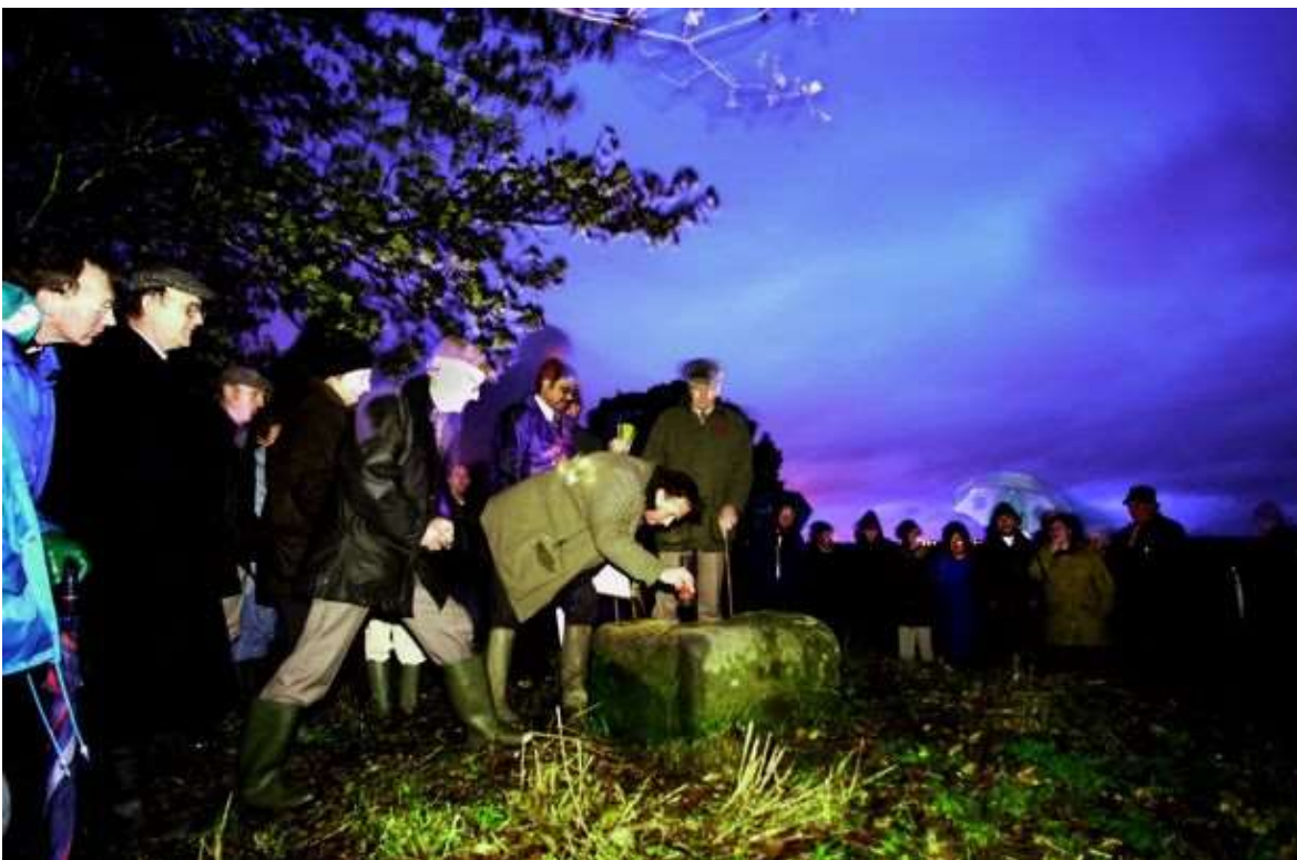
Wroth Silver ceremony at dawn