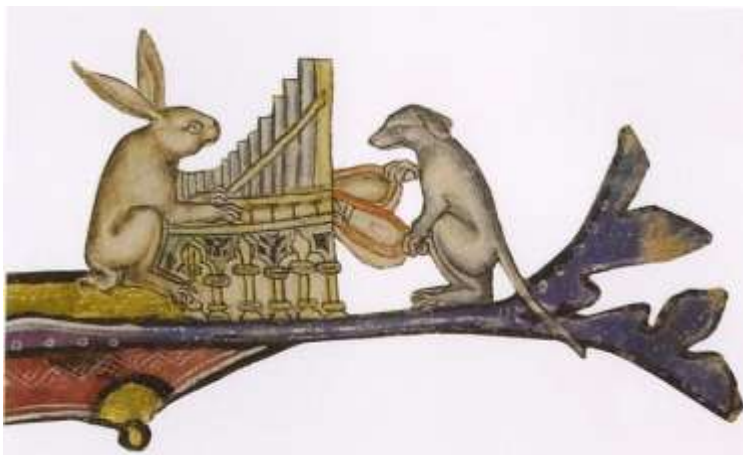
From the margin of a medieval manuscript.