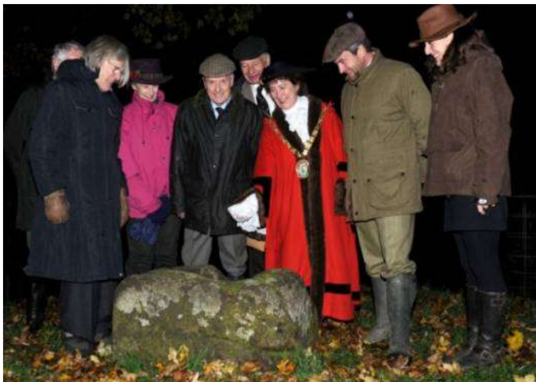
Wroth Silver ceremony 2012

All will then return to The Queens Head for a breakfast and speeches. Please note that breakfast tickets need to be pre-booked directly with the Queens Head, (breakfast cost was £13 in 2014. Included in the price is a glass of rum and hot milk with which to toast the health of His Grace and a churchwarden pipe (tobacco supplied). People will be departing by about 8.45am. Further information on : http://www.wrothsilver.org.uk/