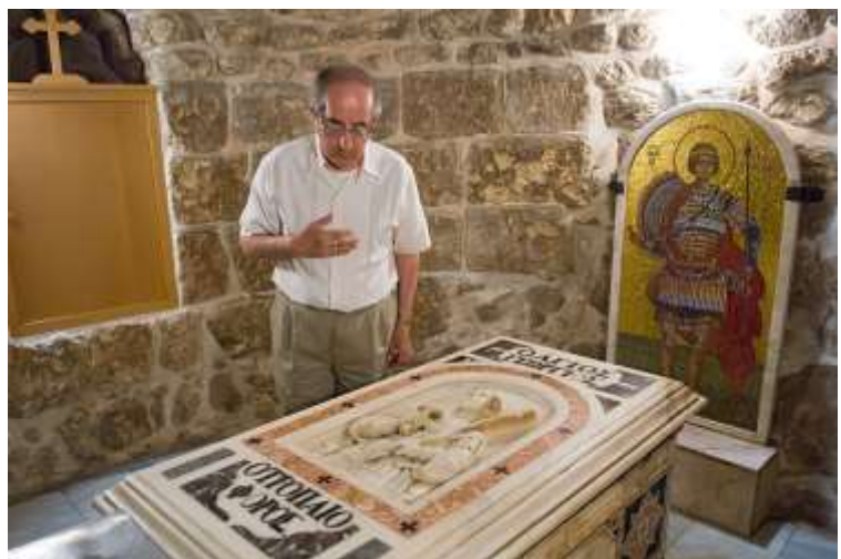
Tomb of St George, Lydda, Palestine.

Christians of all traditions, and also some Moslems, still make pilgrimages to Lydda to honour St. George.