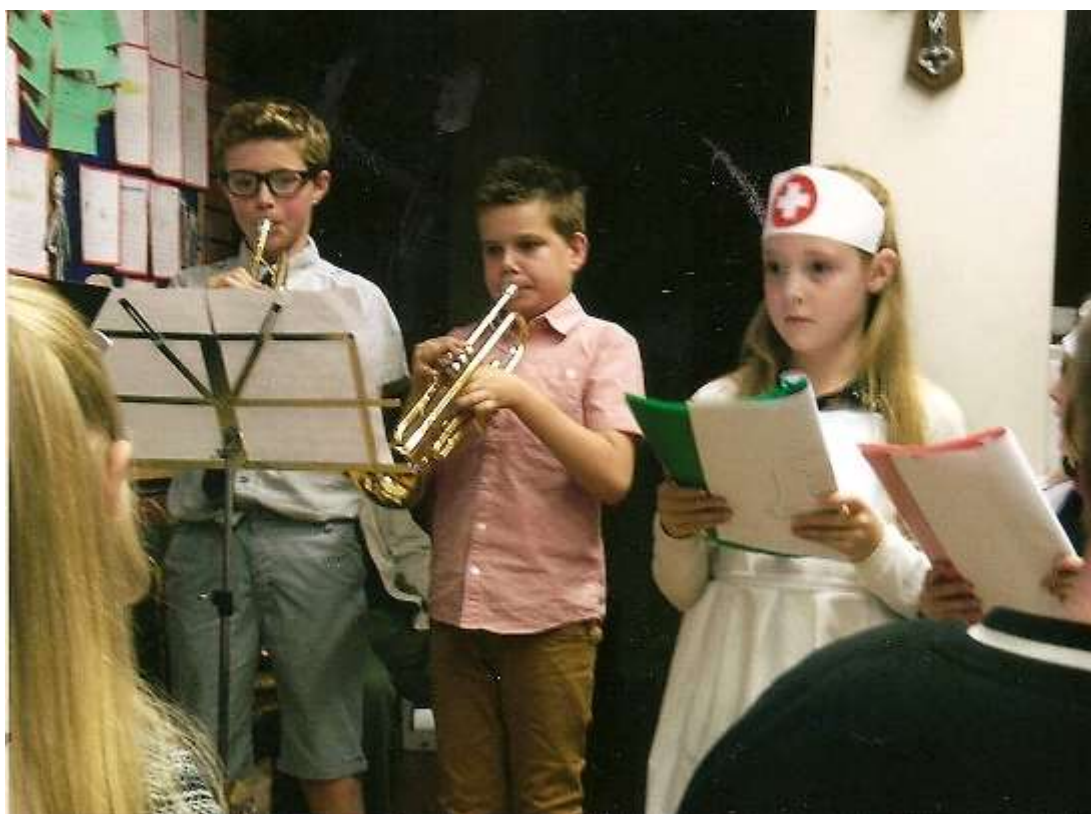
Some of the singers and musicians at “Pack up your troubles”