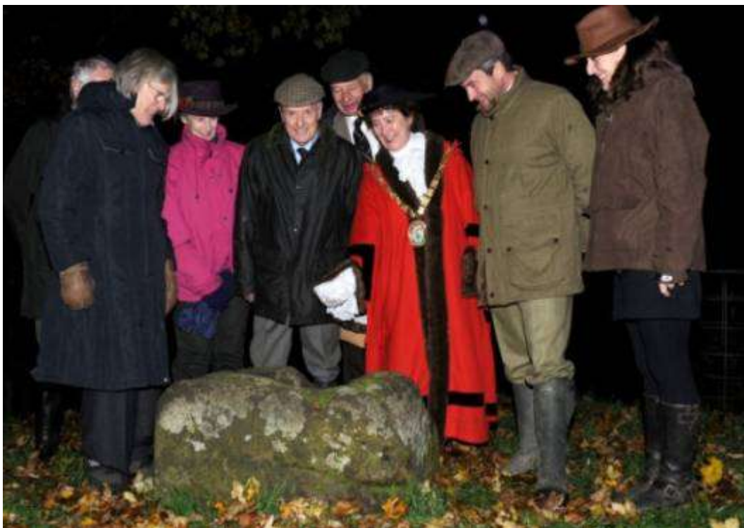
Wroth Silver ceremony 2012