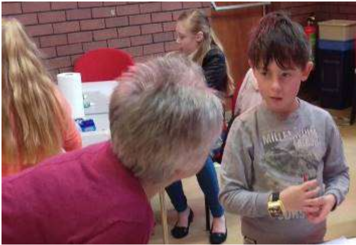
Village Worship- for all ages!